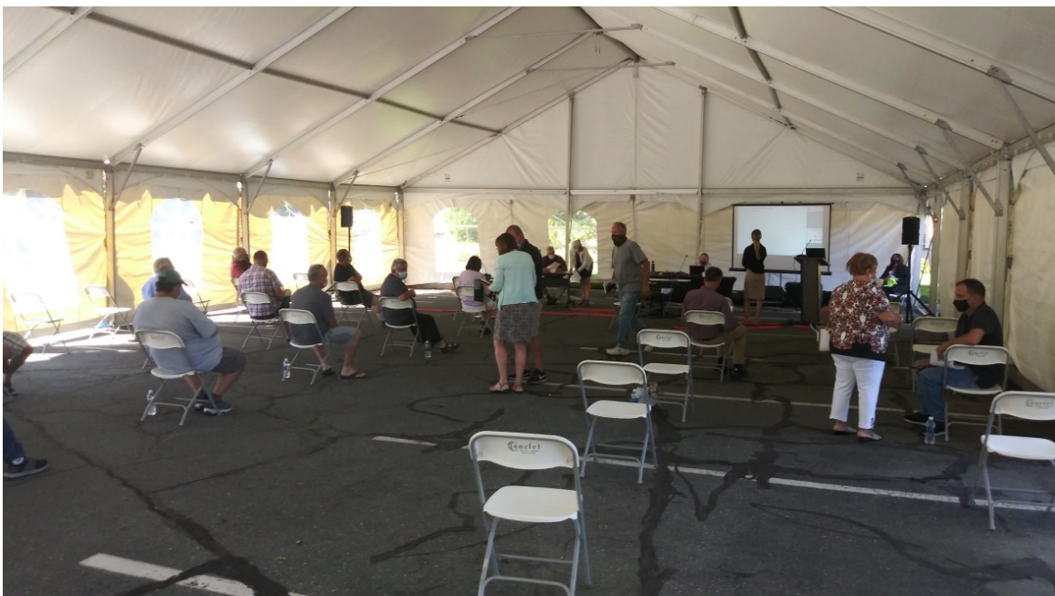
New England Council pre-hearing photo for Groundfish Amendment 23.

The New England Council has been using GoToWebinar and GoToMeeting for all of its virtual meetings. Over the spring and summer, the Council also held a series of public hearings on two important FMP amendments for groundfish and scallops. All were conducted by webinar except for the last groundfish hearing, which was held in person at the request of stakeholders and Council members. The in-person hearing, which was held outdoors under a large tent, took a considerable amount of time, effort and expense to carry out. Unlike some other regions, many of the fishermen in the New England region were not used to webinars before COVID-19. The New England Council has spent time training stakeholders, especially fishermen, on how to join webinars and how to talk on them, not just for the public hearings but for all Council and committee meetings. The New England Council developed a Remote Participation Guide, held several webinar public training sessions, and set up a Help Desk with designated staffers on hand by email and phone to help people deal with webinar problems during Council meetings. The New England Council, which does not do social media, sent additional press releases, Council roundups and targeted emails to keep everyone in the loop as much as possible.