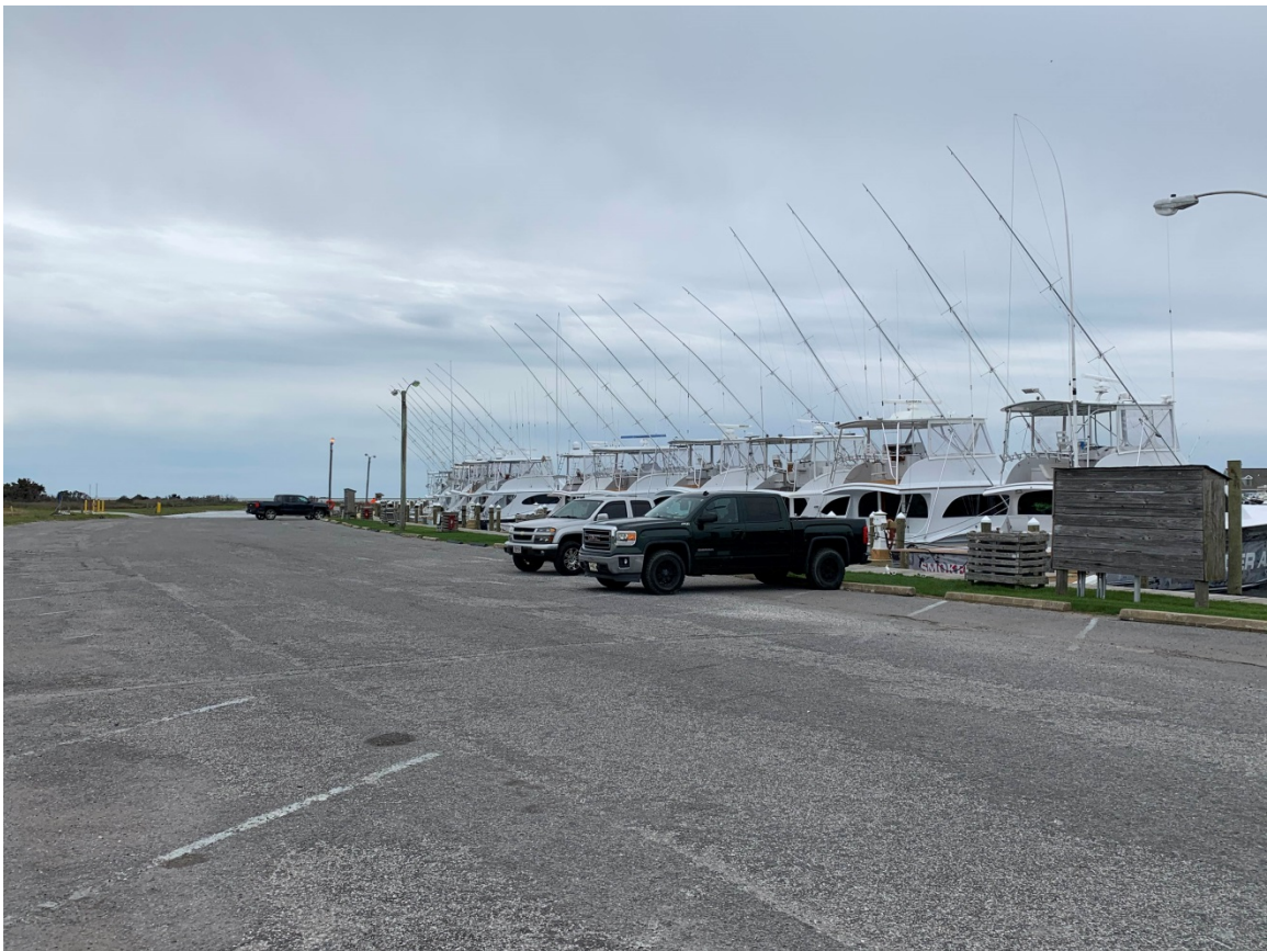
Charter vessels sit idle in Hatteras, on the Outer Banks of North Carolina in March. One of the first coastal communities in the South Atlantic closed to all non-residents as COVID-19 spread, the Outer Banks are highly dependent on tourism and businesses have been severely impacted by the pandemic. The Council's Spring 2020 newsletter focused on such impacts.

While the South Atlantic Council office has remained open, the majority of Council staff has been telecommuting since March 17, 2020. Staff is using GoToWebinar and Microsoft Teams to communicate internally via webinar, and regular staff meetings are held each week. The Council uses GoToWebinar for its public meetings. The South Atlantic Council's first week-long meeting via webinar was held in June. Online public comment forms continue to be used, and the Council held an online formal public comment session during the meeting week. Staff developed an instructional PowerPoint presentation for using GoToWebinar and held practice sessions with Council members and staff prior to the June meeting. Staff also developed an in-house Process Agenda to outline specific staff responsibilities for each Council meeting held via webinar. Advisory Panel and SSC meetings have also been held via webinar. A page on the Council's website was created to provide information and resources relative to COVID-19 as needed. The spring 2020 issue of its South Atlantic Update newsletter was dedicated to COVID-19 impacts to data collection, Council operations and impacts to individual Advisory Panel members. Respecting the hardships of fishermen and others, the Council delayed appointments for open seats on its Advisory Panels initially scheduled for its June 2020 meeting. Social media (Facebook, Twitter and Instagram) continues to be utilized for communicating with constituents.