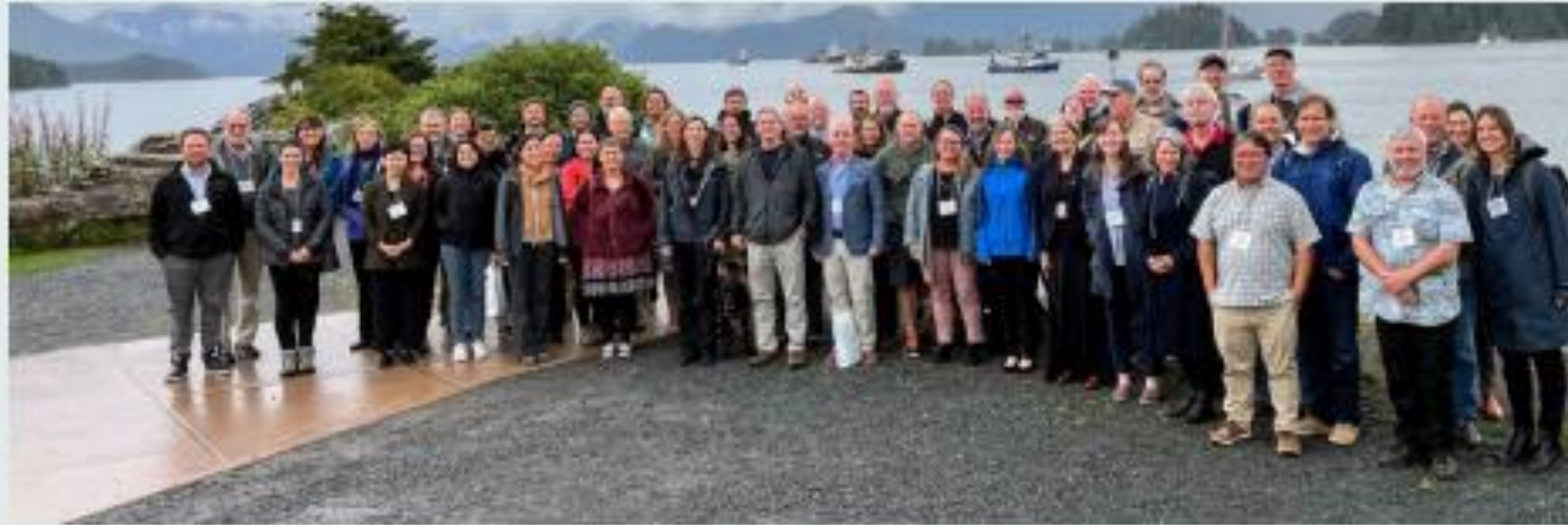
SCS7 Delegates in front of Crescent Harbor, Sitka, Alaska