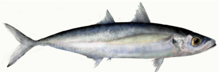
Big eye scad (left) and mackerel scad.